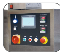
Easy to use touchscreen controller