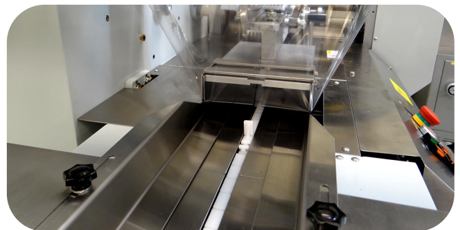
Delicate product conveyor with carrier card in-feed guide rails to handle product transitioning to the custom fixed former.

Carrier Card Guide Rails —Infeed guide rails to support carrier cards