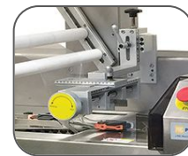
The standard film former manually adjusts to meet a range of package sizes